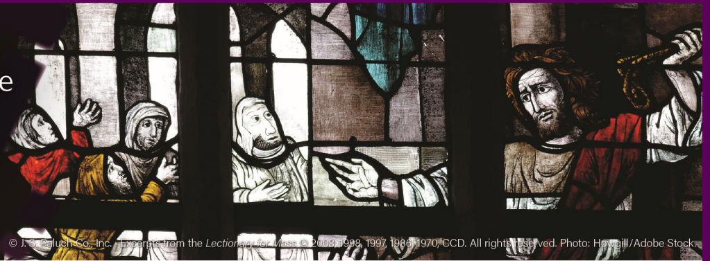
© J. S. Pugh Co., Inc. Excerpts from the Lectionary for Mass © 2008, 1998, 1997, 1986, 1970, CCD. All rights reserved.