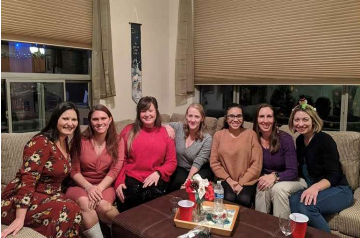
Mom's Night Out at the Women's Ministry Christmas Party

January 24-26: Women's retreat at Picture Rocks Please email us for more information and sign up forms.