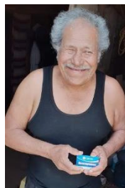
Haitian group living in