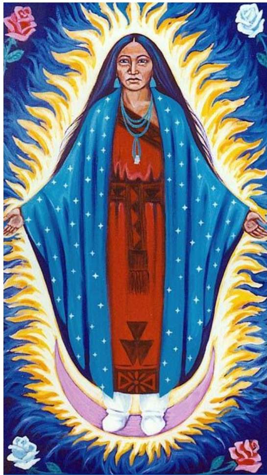
Feast of Our Lady of Guadalupe Dec 12