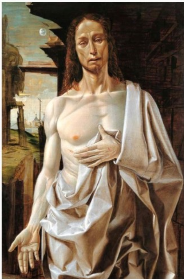
The Resurrected Christ by Bramantino (1490)