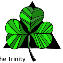
The shamrock is a symbol of the Trinity