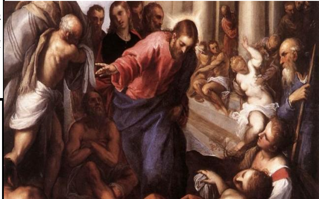
Jesus casts out unclean Spirits—by Palma Giovane (1548-1628)