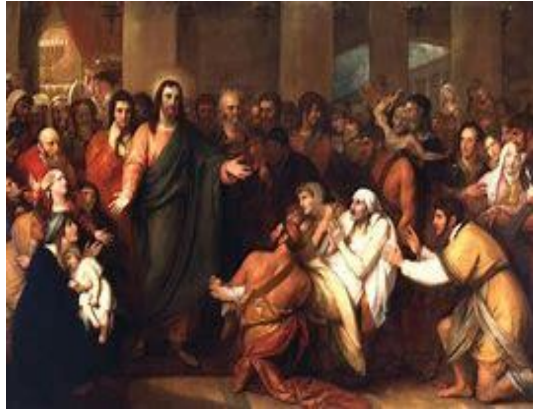
Jesus heals the Sick in the Temple—by Benjamin West 1738-1820