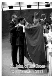
Photo Tips for Sponsors

One Photo is $15 - 2 for $25 Makes a great gift for the sponsors