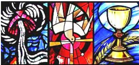
OFFER, STRENGTHEN, SUSTAIN