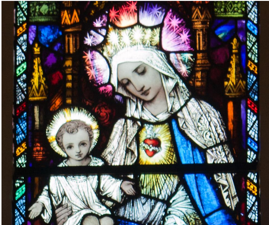
CLONMEL SS. PETER AND PAUL'S CHURCH WEST AISLE WINDOW, HEART OF IMMACULATE MARY,

St. Andrew's has been blessed by God with a holy relic of the True Cross, which is also from where Our Lord entrusted His Mother with the priesthood through her first priest-son, St. John the Apostle. We seek, by God's grace, to live out this prayer ministry in the image of Our Lady united to Christ on the Cross, as well as throughout His earthly ministry, and her entrustment as both Mother and Queen of the Clergy. We are called to help carry the Cross of our priests and walk beside them through our prayers and sacrifices.