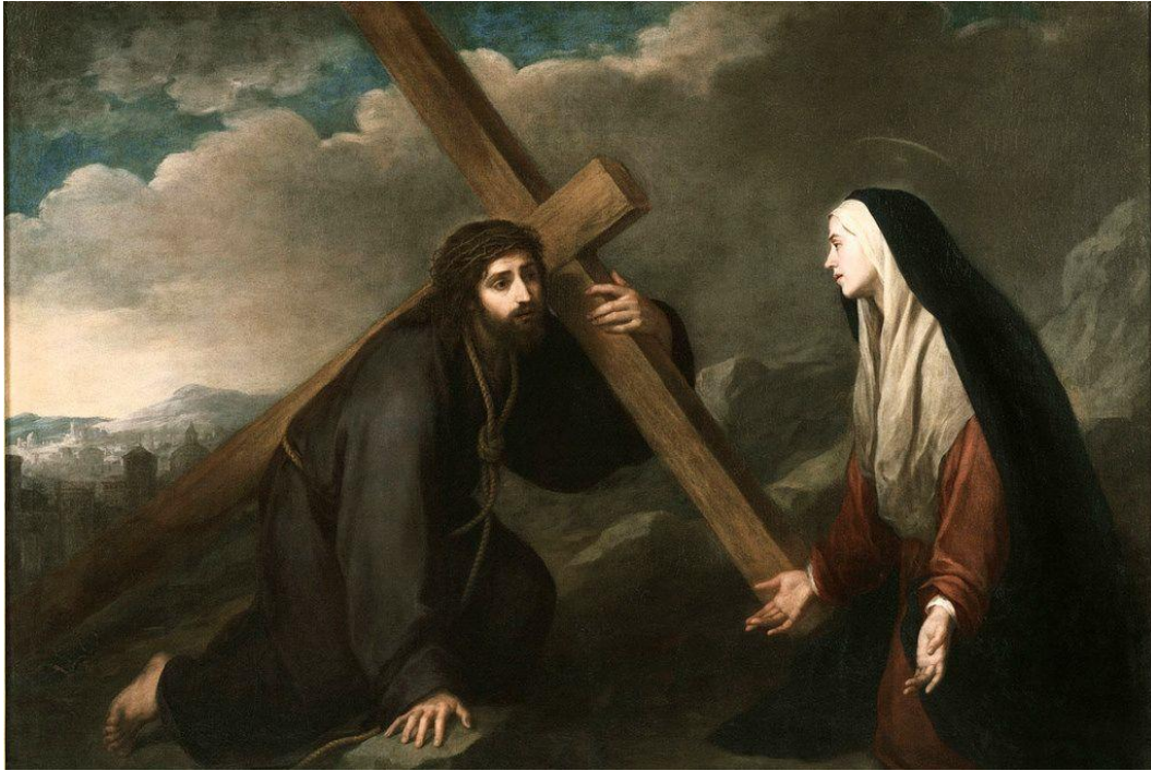
CHRIST MEETS HIS MOTHER WHILE HE CARRIES THE CROSS, BARTOLOME ESTEBAN MURILLO, 1617-1682.

Mission: Our Lady of the Holy Cross Women's Prayer Ministry for Priests is imaged after the spiritual motherhood of Our Heavenly Mother in relation to Her Divine Son under her title of Our Lady of the Holy Cross. Our Heavenly Mother, during Her Divine Son's earthly life, and now from eternity, is always united to the Eternal High Priest, Jesus Christ, through her Immaculate and Sorrowful Heart. Our priests are called to full union with Christ Crucified on the High Altar of the Cross by virtue of their priestly ordination and through the celebration of the Holy Sacrifice of the Mass, which is the re-presentation of Christ's sacrifice on the Cross for the salvation of souls.