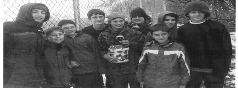
The Vikings sending the Viking Thor on his way to his home land (he’s in Paris right now)