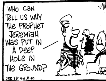
20 TH SUNDAY IN ORDINARY TIME

*For Holy Days, please check elsewhere in this bulletin for the correct time of Masses.