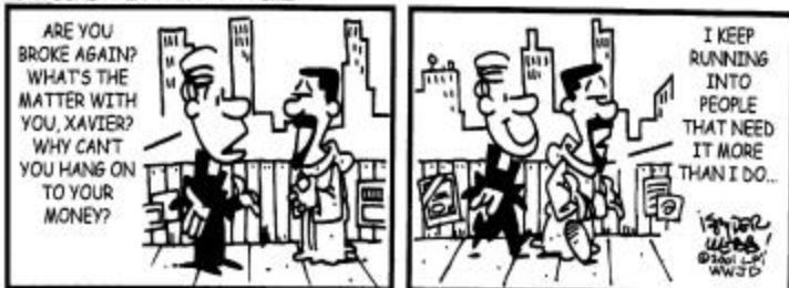
25TH SUNDAY IN ORDINARY TIME

Maybe the problem lies in the fact that, at times, we are merely lukewarm fans of Jesus and not disciples. If we truly have matured in our faith and strengthened our relationship with him, then real commitment comes easier. There will always be a temptation for money to take the place of Jesus, but the more committed we are, the harder it is to allow anything to come between us and our God. The question we all must continually ask ourselves is, "Is God truly the most important thing in my life?"