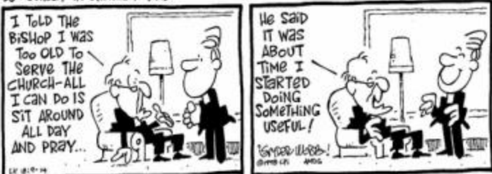
30th SUNDAY IN ORDINARY TIME

We all have within us both the Pharisee and the tax collector. We want to be sure of ourselves and to be admired in the eyes of others. Yet we also know that we are not always what we wish to present to others. We can be preoccupied with our self-image and feel anxious about our flaws being exposed. Because we do have flaws, after all. We are the sinner in need of mercy. This Sunday, will we humble ourselves enough to ask for it?