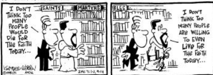
32 nd SUNDAY IN ORDINARY TIME

Drop this form in the collection basket.