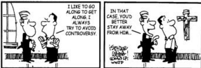
PRESENTATION OF THE LORD

Drop this form in the collection basket.