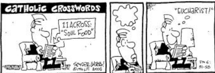
The Body & Blood of Christ

Drop this form in the collection basket.