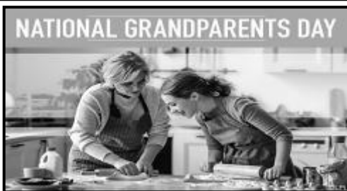
Sunday, September 13

Call Kathy at #315-507-2528 to add anyone to this list. (5/18)