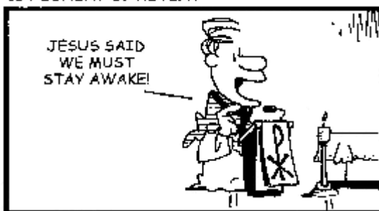
1ST SUNDAY OF ADVENT

Go to: https://bible.usccb.org/bible/readings