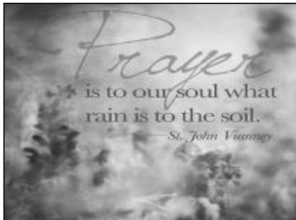
A Prayer to Be Open to God's Will

Divorce Support Anonymous Group At The Good News Center 10-week program starting 9.23.21 For Full Information, call 315-735-6210 Participants must register by September 16