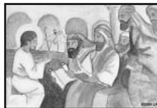
Jesus teaching The Teachers in the Temple

We may sometimes feel that we are alone. We may at times try to do too much or show others that we are independent and strong. However, without the help of others, without the help of God, true success will always elude us. Our actions and words can become empty. The gifts we have received can either be cultivated in secret and in the shadows, or we can welcome the help that God provides in his Spirit, his community, and the sacraments he gave us. By working together the world will truly know the power of the risen Lord.