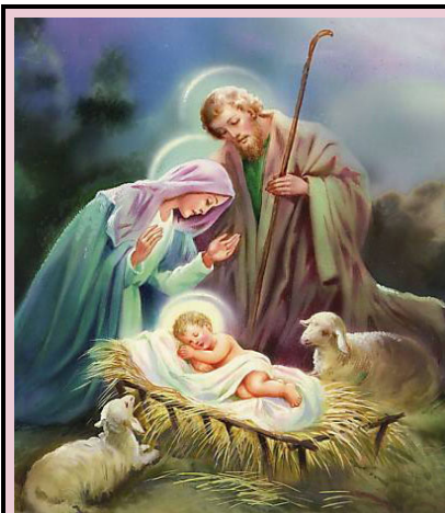
The Holy Family of Jesus, Mary and Joseph