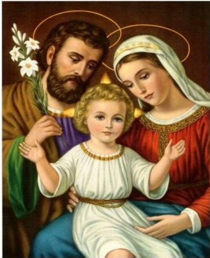
The Holy Family of Jesus, Mary and Joseph