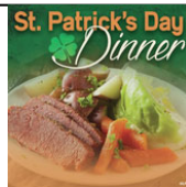
St. Patrick's Day Dinner

Sponsored by the St. Patrick Knights of Columbus Culture of Life Program