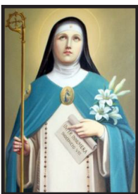
Saint Angela of Foligno Saint of the Day for January 8 (1248-January 4, 1309)