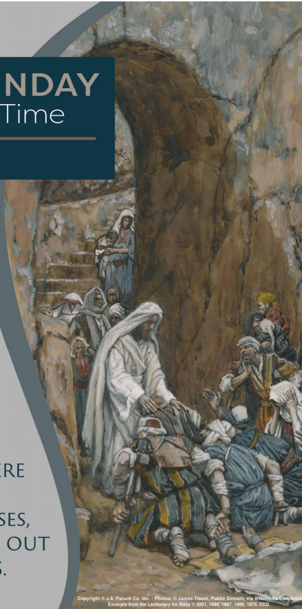
Copyright © J.S. Paluch Co. Inc. - Photos © James Tissot, Public Domain, via Wikimedia Commons Excerpted from the Lectionary for Mass © 2001, 1989, 1987, 1985, 1970, C.O.C.