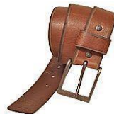
Plain Brown Belt