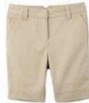
Boys/Girls Bermuda Shorts