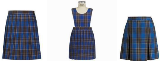
Girls Skirts and Jumpers (PK/K should wear Jumper)