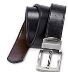
Reversible Brown/Black Belt