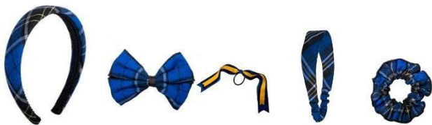
Girls Hair Accessories