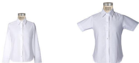
Boys/Girls Long or Short Sleeve Shirt with Logo

Only outerwear for Mass and School Days where a heavy winter jacket is not required