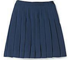
Girls Pleated Skirt