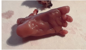
Image of Aborted Baby's Foot Shows Humanity of 17-Week-Old Baby Killed in Abortion

A pro-life group has accused an Ohio abortion facility of throwing a dismembered, aborted baby