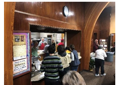
Knights serve food at Turkey Bingo on November 9.