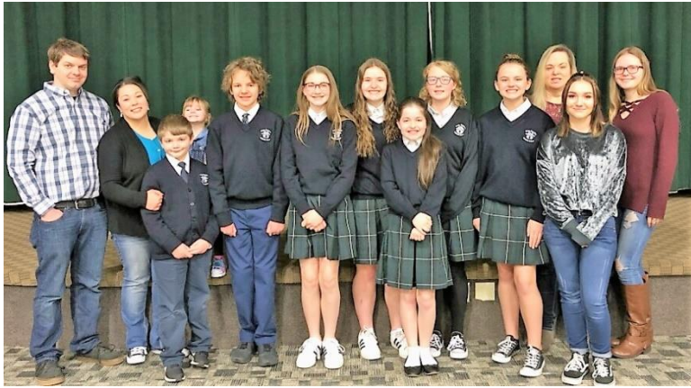
Parents and students who helped at recent knights' breakfast for Holy Family Catholic School.