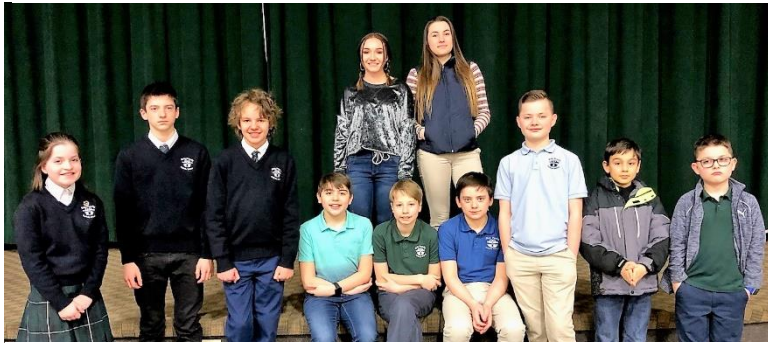
Students who helped at recent knights' breakfast for Holy Family Catholic School.