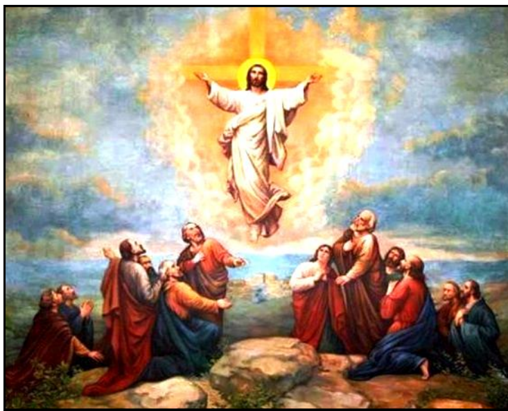
"I am with you always, until the end of the age." - Matthew 28:20