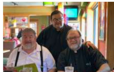
Our last three Pastors of St. Juliana's Catholic Church