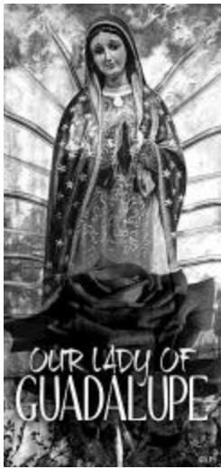
This prayer is from the USCCB