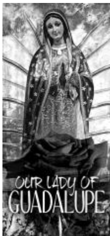
This prayer is from the USCCB

Estamos preparados para recibir sus donaciones en línea. Puede visitar nuestro sitio web en www.stjohnsmarblefalls.org haz clic en Donate (esquina derecha de la página, y proceder con su donación. También puede mandar por texto la cantidad de su donación con las palabras StJohnMarbleFalls al 73256.