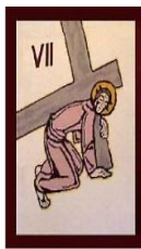
Jesus falls a second time.

- There is a Sign-up Sheet at St. Paul's (parking-lot side entrance) for volunteers to bring a pot of soup (to be meatless with no use of chicken/beef stock) and bread.