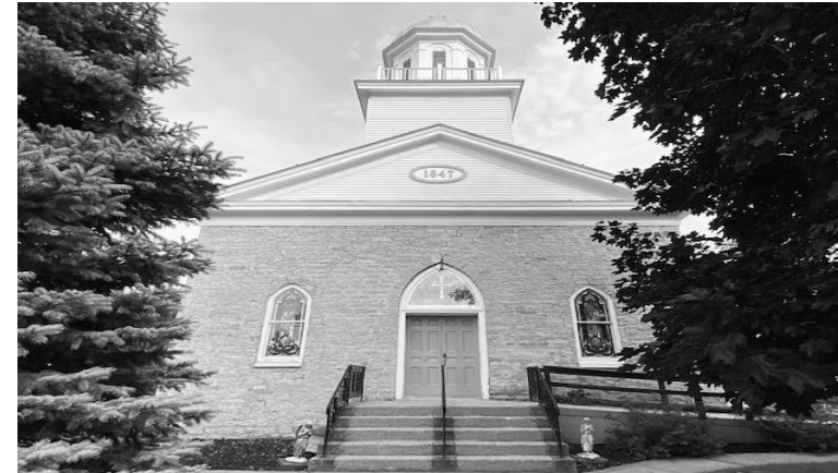
St. Mary's Church, Inc. 1920