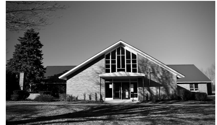
St. Paul's Church, Inc. 1900