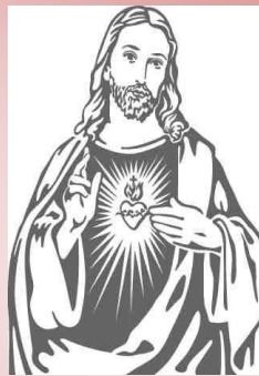
Sacred Heart - Langton