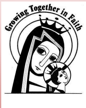
St. Mary's - Tillsonburg