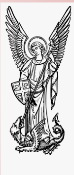
St. Michael's - Walsh