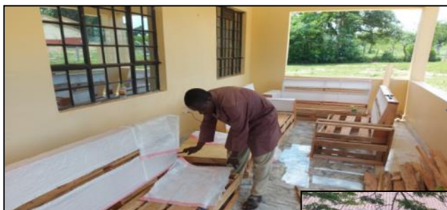
On-going furniture construction works inside the new Rectory.