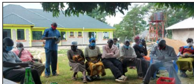
St Teresa of Avila Kwangamor Church leaders meeting at the new Rectory site to discuss urgent fundraising plans.