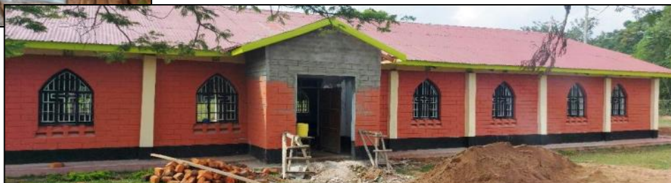
Ongoing works at St Teresa of Avila Kwangamor Church, soon to be created as new parish out of the current Amukura.