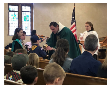
A scout is reverent!