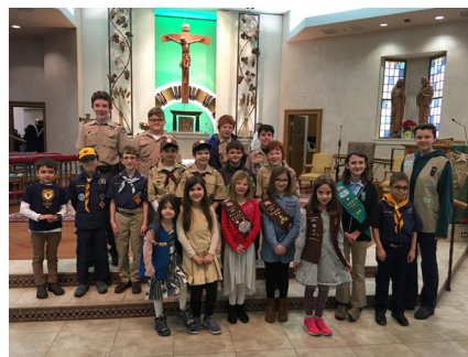
Scout Sunday, celebrated at the 11am Mass at St. Bede last week.