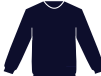
Sweatshirt w/ logo