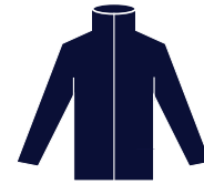
Polar Fleece w/ logo