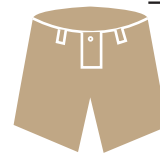
Khaki Dress Short w/ logo