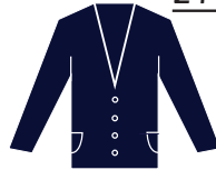
2 Pocket Cardigan w/ logo