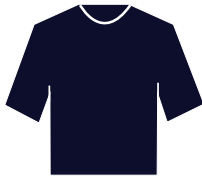
SS T-Shirt w/ logo