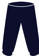
Sweatpant w/ logo (Elastic or non-elastic)