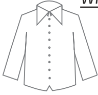
White LS BD Dress Shirt