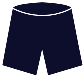
Gym Shorts w/ logo