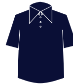
Navy SS Polo w/ logo