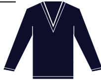
Varsity V-Neck w/ logo