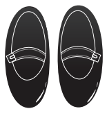
Black School Shoes