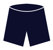
Gym Shorts w/ logo