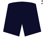
Navy/Black Fun Shorts