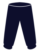
Sweatpants w/ logo (Elastic or non-elastic)