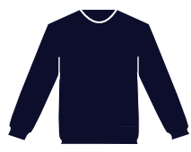
Sweatshirt w/ logo