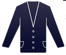
2 Pocket Cardigan w/ logo