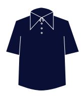
Navy SS Polo w/ logo