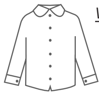
White LS RC Blouse