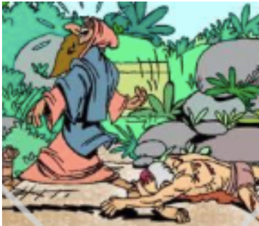
A Priest sees the man and walks by and does not help.