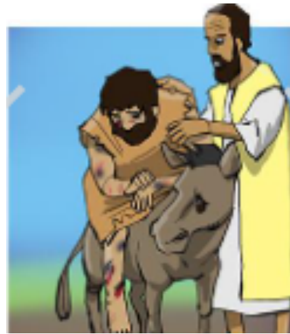
A man who did not like Jewish people helped the injured Jewish Man.