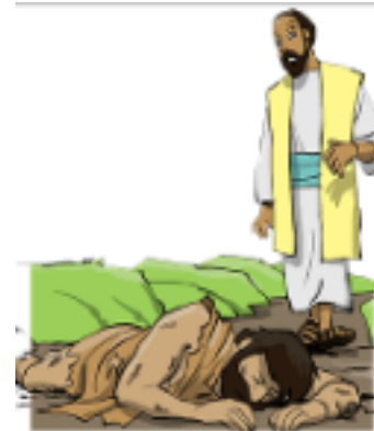
A man from Samaria sees the injured traveler.