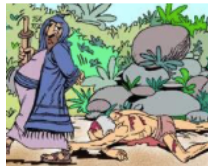
A Priest helper walks by, sees the man and does not help.