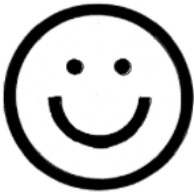
This story teaches us to love all people, even those we may not like.