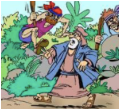
A Jewish man gets robbed and beaten up while travelling.