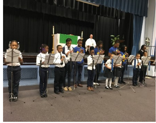
St. Benedict the Moor School Catholic Schools Week "CATHOLIC SCHOOLS: LEARN. SERVE. LEAD. SUCCEED" January 27th-31st