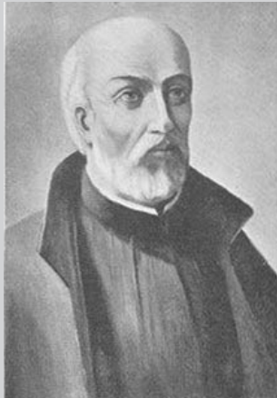
St. John de Brebeuf