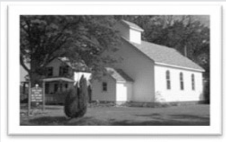
Star of the Sea