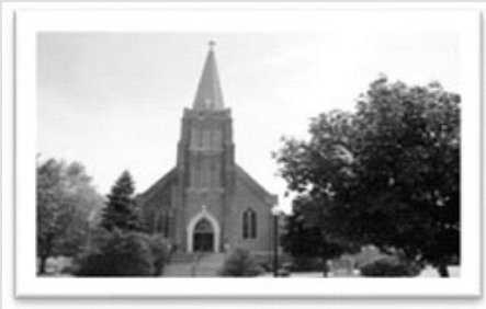
St. John de Brebeuf and Companions