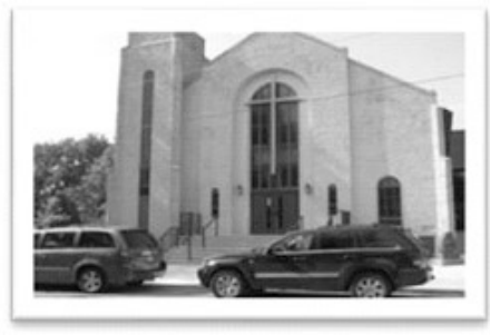
St. Anthony of Padua