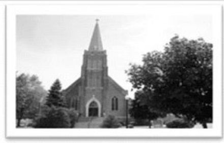
St. John de Brebeuf and Companions