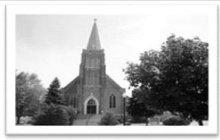
St. John de Brebeuf and Companions