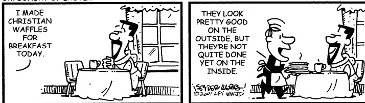
5th SUNDAY OF EASTER