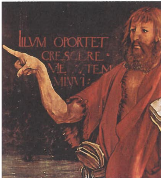
NICOLAUS OF HAGUENAU AND MATTHIAS GRÜNEWALD: JOHN THE BAPTIST. DETAIL OF THE BETHLEHEM ALTARPIECE