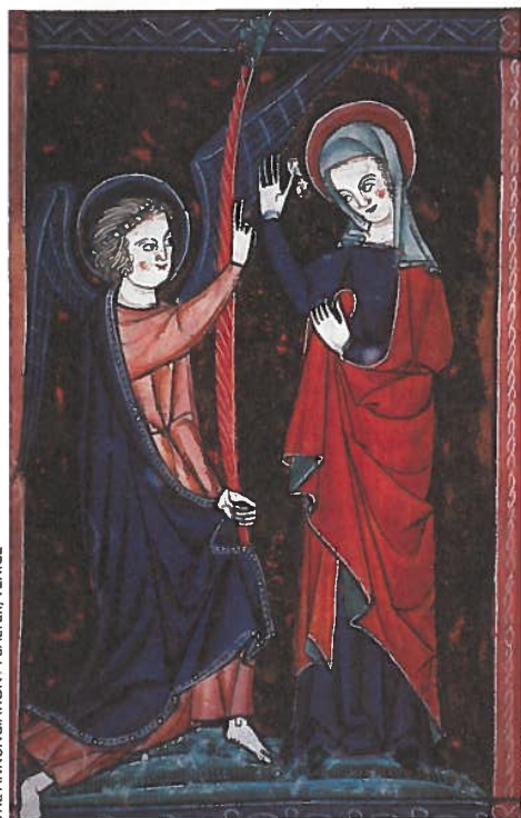
THE ANNUNCIATION / PSALTER, VENICE